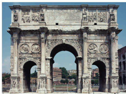
THE LAYOUT OF ROME VS. DC & TRIUMPHAL ARCHITECTURE

This program is presented by The Shenkman Career Services Fund; Co-sponsored by the Department of Classical & Near Eastern Languages & Civilizations and GW Libraries.