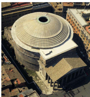
THE PANTHEON OF ROME VS. THE PANTHEONS OF D.C.